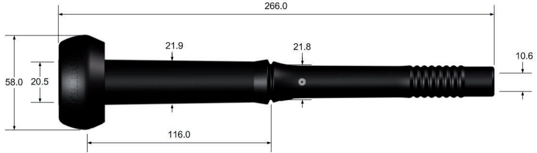
NB Dimensions in millimeters (mm)

MILK-RITE® animal health and milk quality