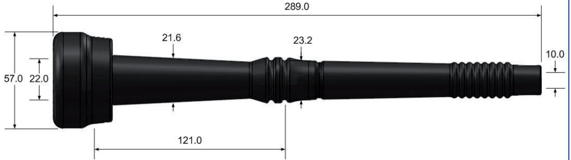
NB Dimensions in millimeters (mm)

MILK-RITE® animal health and milk quality